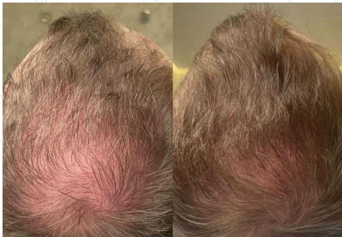
Hair X (Peptide) 5 procedures once in 7 days

80% of the patients notice reduction in hair loss after 4 weeks of use