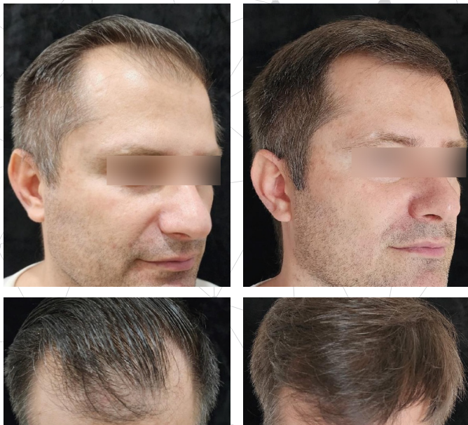
Hair X (DNA Peptide) 10 procedures once in 7 days + Hair X Lotion daily